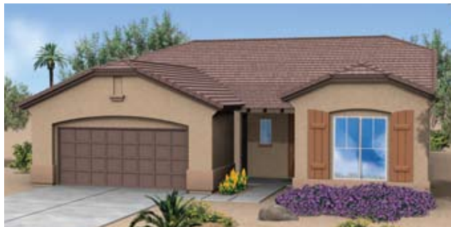
Exterior Design B