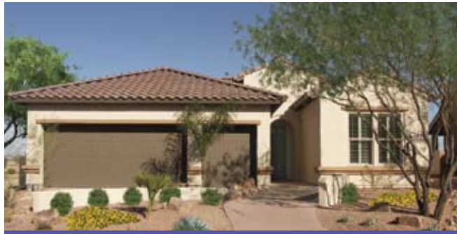
Exterior Design A