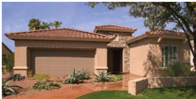
Exterior Design C

Directions to SaddleBrooke from Tucson International Airport: Drive North on Tucson Blvd. to Valencia - turn left - approximately 3 miles you'll see the on-ramp to I-19 on your right. Take I-19 to Tucson/I-10 junction. Travel West on I-10 (North towards Phoenix) 12 miles to Ina Road (Exit #248). Exit and turn right on Ina - travel East 6 miles and turn left on Oracle Road. Continue North through the town of Catalina to SaddleBrooke Blvd. and turn right. Continue East 2 miles on SaddleBrooke Blvd. then turn right on MountainView Blvd. and follow signs to the Model Homes.